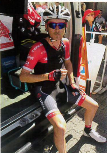
TREK CYCLING TEAM