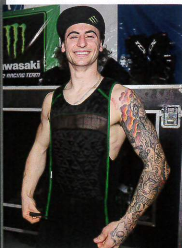
MX2 MONSTER TEAM KAWASAKI