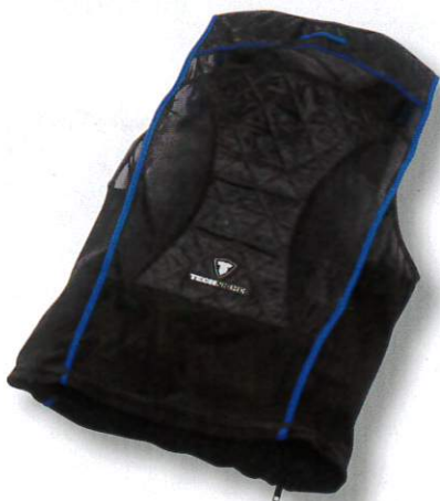
BLACK/BLUE BACK VIEW